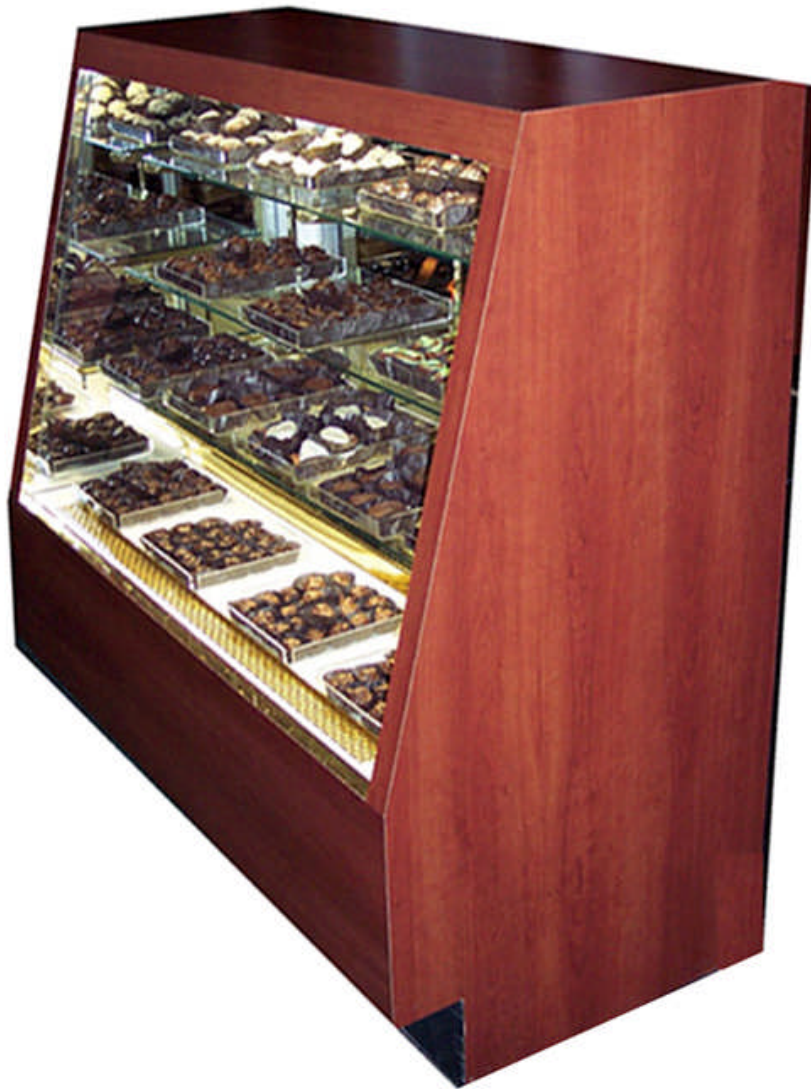
Angled Straight Front Bakery Merchandiser