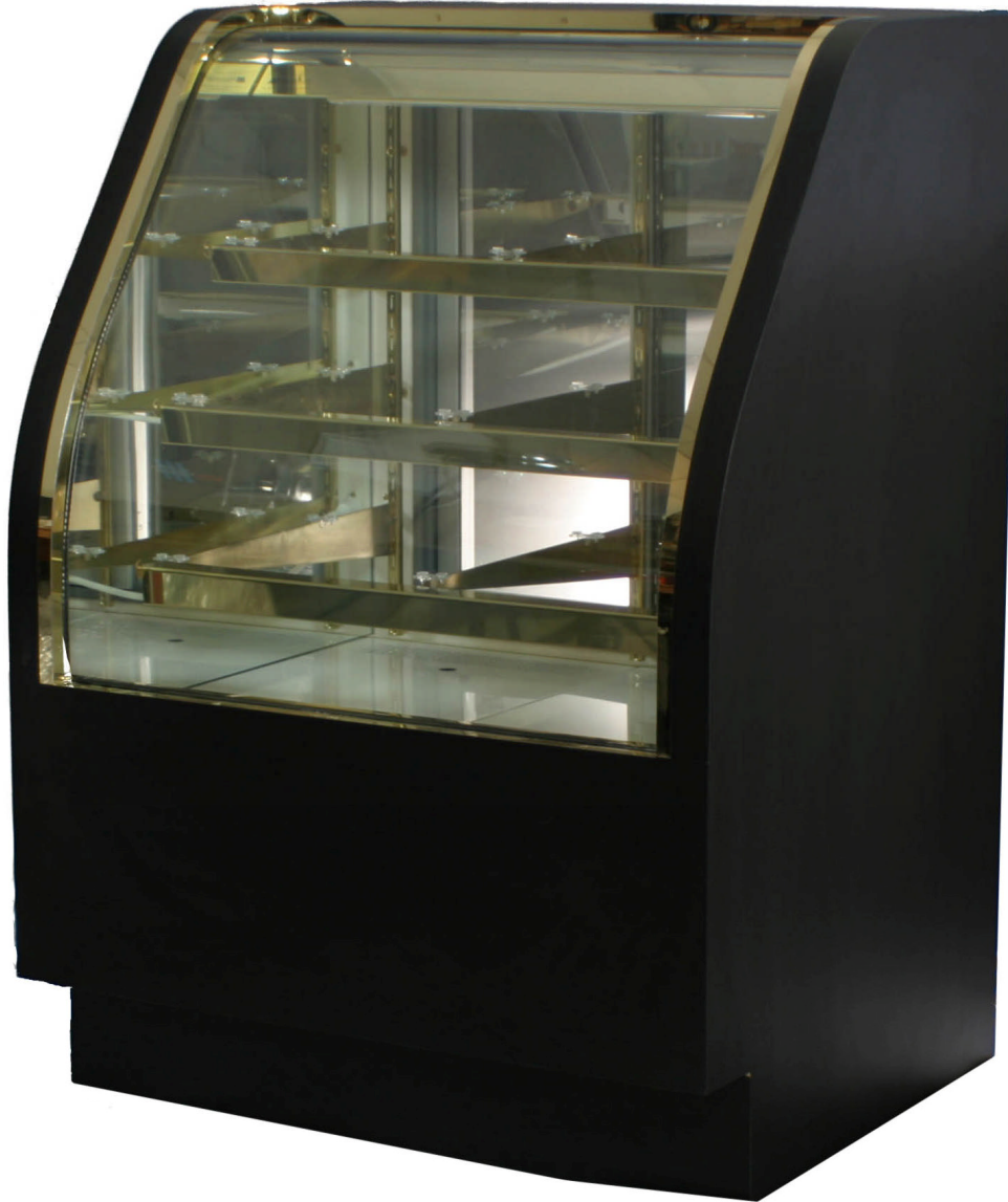
Double Bend Front Bakery Merchandiser