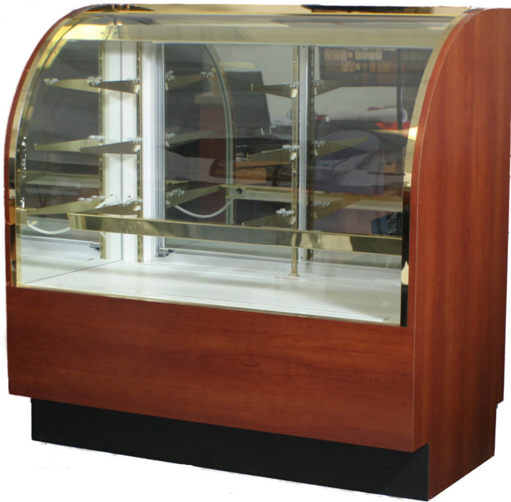
Curved Front Candy Merchandiser