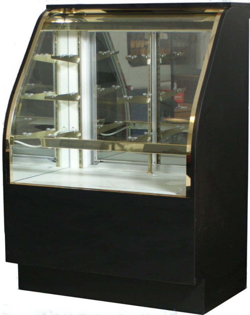
Curved Front Candy Merchandiser