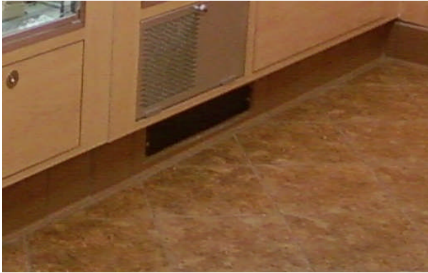
Ceramic Cove Base

Check food safety sanitation codes with local authority to determine approved method of securing your new display case in position.