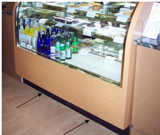
Silicone Bead Permanently Sealing Display Case to Floor. Case Must be Sealed on All Sides.